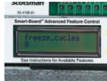
Diagnostic capabilities on screen or transmitted remotely

This optional advanced feature control provides you with operational data that can be displayed on-screen or transmitted remotely for early alert and fast diagnosis of operational issues. With this optional feature, Prodigy™ cubers meet NAFEM data protocol capabilities for smart kitchen applications.