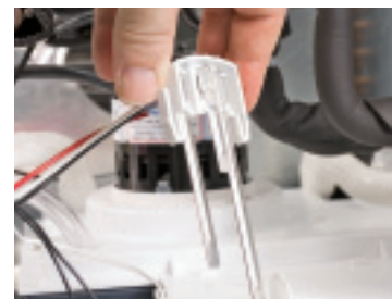
Electric conductivity-based water sensor

The patented WaterSense adaptive purge control reduces scale buildup by detecting hard water conditions and purging mineral laden water with every freeze cycle for maximum reliability and a longer time between cleanings. It constantly measures the minerals in the water and automatically adjusts the purge water amount to minimize scale buildup in every type of water.