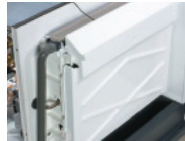
Helps keep your ice fresh and pure