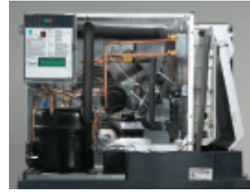
Open design with all components accessible

All Prodigy™ cubers are protected with Scotsman AquaArmor™, which utilizes AgION®, a silver-based antimicrobial compound molded directly into key ice-machine components. This built-in compound reduces the growth of bacteria, microorganisms, algae, mold, and slime on ice-machine surfaces. Match this with Scotsman's other sanitation products to further defend your ice machine against undesirable microbes, bacteria, mold, and algae. Refer to the water filtration and sanitation matrix to match the right cleaning product to your water conditions.