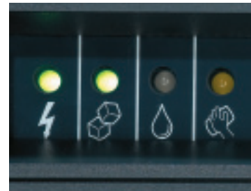
Easily monitor status without opening up the cabinet

Prodigy™ AutoAlert™ external indicator lights continually communicate the machine's current status for complete confidence in its ice-making capability. The ability to immediately alert staff of key operational issues is a valuable tool in maintaining high levels of ice production and minimizing performance interruptions.