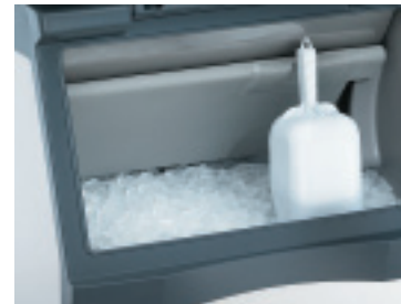
Take complete control of your ice-making level

Using field-proven ultrasonic technology, the Vari-Smart™ ice-level control maintains the ice level you set to keep just the right amount of freshly made ice in the bin. Along with the Smart-Board™ control, this feature allows you the flexibility to program your ice level for up to 7 days. That means customers get fresh ice while you save water and electricity.