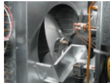
Unique fan-blade design helps reduce noise

With a unique fan-blade design, quieter compressors, and a special sound shield, Prodigy™ cubers reduce the noise of ice making versus competing models. All external panel components are crafted for superior fit and finish and aesthetic appeal. For the ultimate in quiet operation, Prodigy Eclipse offers the ability to locate the compressor, condenser and receiver remotely. Noise and heat are moved away from workers and customers, improving surroundings.